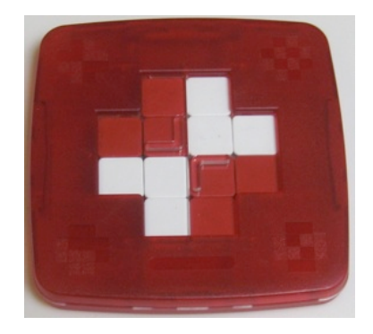
Patented by G. Pahud 2005, purchased from www.swissmad.ch. (plastic, 3.25 inches square by 3/8 inch thick)

A cross of 12 squares visible on both sides, where each side of each square is colored red or white (there are exactly three squares of each of the four possible combinations of red and white). The front has ridges on two of the center squares that can be used to slide each of the two columns up or down by one square and the back has ridges on the other two center squares that can be used to slide each of the two rows left or right by one square. The directions have the eight patterns shown below (this one came with Diversity on the front and Time on the back).