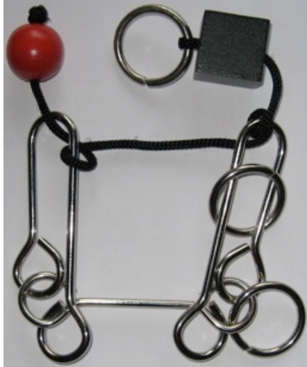
Family Games Inc. 2005. (nylon cord, wood ball and block, 1/8" diameter metal wire, 6 inches)

Referring to the photo above, a left and right arm are joined along the bottom by a third wire piece. A cord goes from the ball, around the left arm, around the right arm, through the block to a ring. The block cannot pass through a ring but the ball can; however, it is only the ring on the right arm through which the ball passes in solving the puzzle (the ring on the lower right just serves to prevent one from flexing the right arm and passing the ring on the right arm around the bottom). The goal is to remove the ring from the right arm.