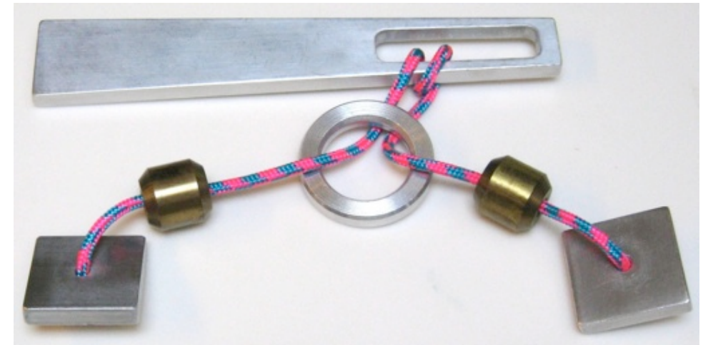
Old design, this one made by J. A. Storer, circa 1990. (made from 1/4 inch aluminum plate and 3/4 inch diameter brass rod, 6.5 inches; the design of this puzzle reflects the figure in Coffin's Puzzle Craft book)

The square fits through the slot but not the ring. The ball fits through the ring, but not the slot. The ring fits through the slot and can pass over the narrow end past the slot, but not over the wide end. The task is to remove the ring. It can seem easier to put the ring on; one can retie the string with only one loop around the middle and first learn how to put the ring on.