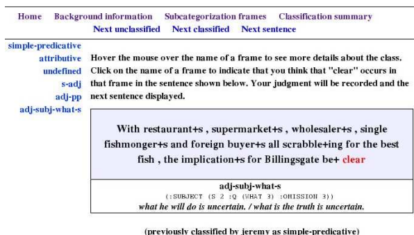
Figure 6: Sample classification screen for web annotation tool

ular sentences could not be classified (which is useful for further system development, as discussed in section 5). A screenshot is shown in figure 6. The resulting annotation revealed 19 of the 30 SCFs in the test data.