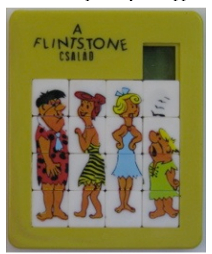
Flintstones, circa 1965? (plastic, 3.6 by 2.9 inches)

Like the Fifteen puzzle except there are sixteen pieces and a seventeenth extra space. The piece adjacent to the extra space in the solved position will always either be there (in which case no pieces can move until it is moved into the extra space) or be in the extra space. So this puzzle can be solved by first placing this piece in the extra space, solving the remaining Fifteen puzzle, and then moving this piece back. The position of the extra space does not matter, and varies from one puzzle to another. Here's one with the extra square by the upper right corner: