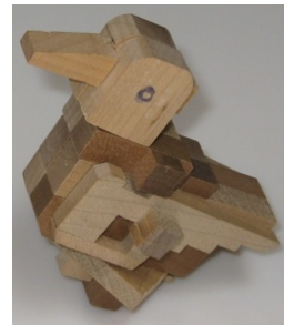
Bird, 3.5 inches.