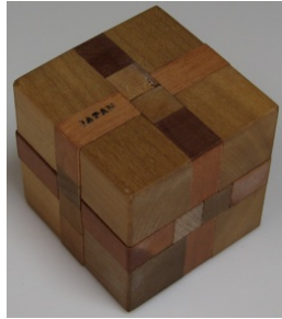
Cube, 2.25 inches.