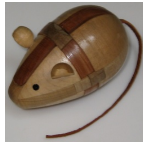
Mouse, 3 inches + leather tail.