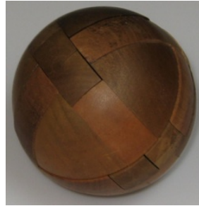
Ball, 2.25 inches.