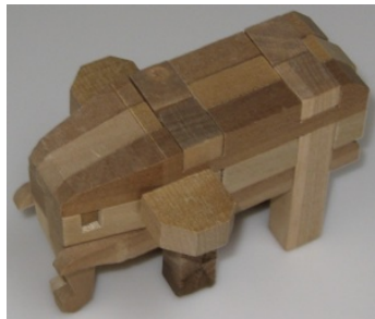
Elephant, 3.4 inches.