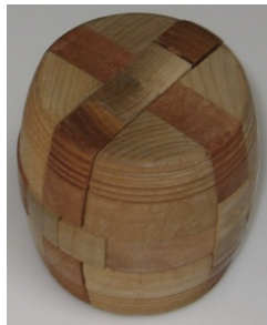
Barrel, 2.2. inches.