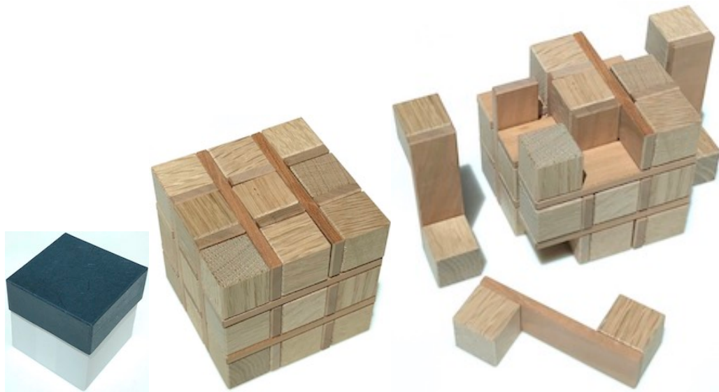
Play2Cube Part2 Puzzle