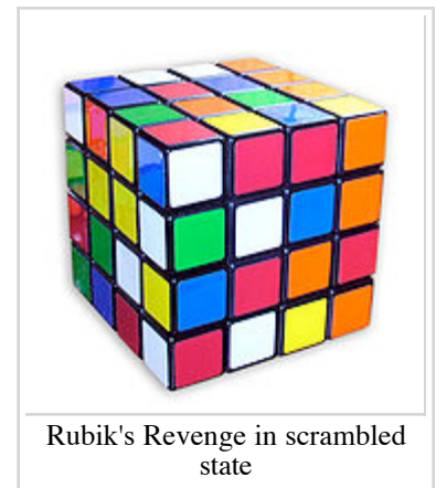
Rubik's Revenge in scrambled state

The original mechanism designed by Sebestény uses a grooved ball to hold the center pieces in place. The edge pieces are held in place by the