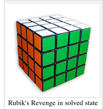
Rubik's Revenge in solved state

Methods for solving the 3×3×3 cube work for the edges and corners of the 4×4×4 cube, as long as one has correctly identified the relative positions of the colours — since the centre facets can no longer be used for identification.