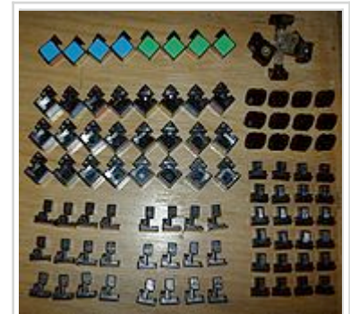
A disassembled Eastsheen 4x4x4.