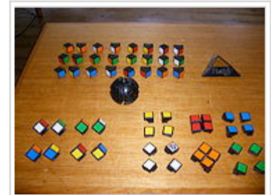
A disassembled Rubik's Revenge, showing all the pieces and center ball.