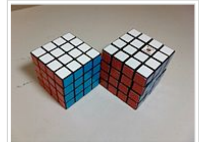
An Eastsheen cube is on the left, and an official Rubik's Revenge is on the right.