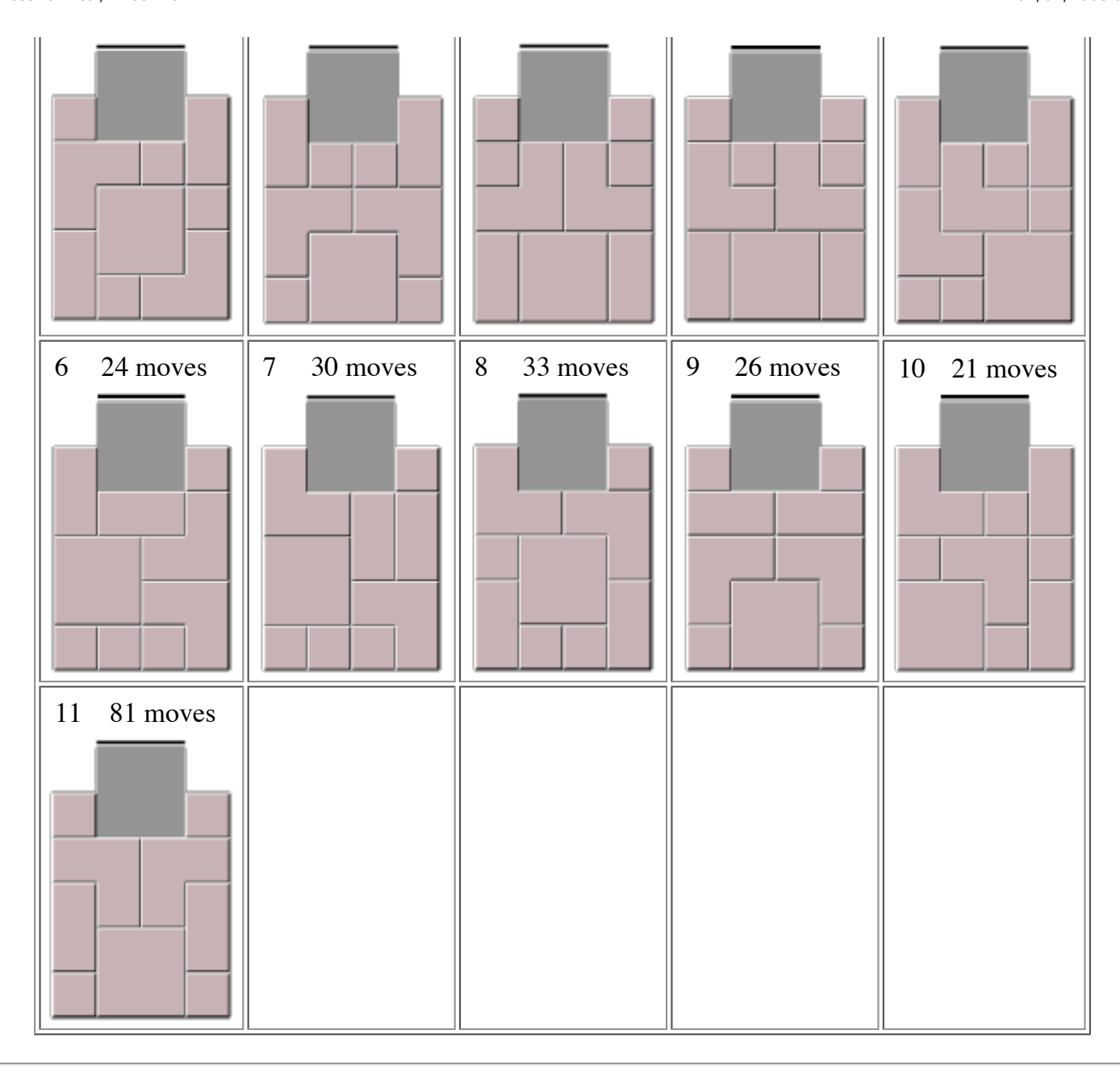
Sliding Piece Puzzles

Sliding Piece Puzzles / "Block 10" 01/01/2008 05:53 PM