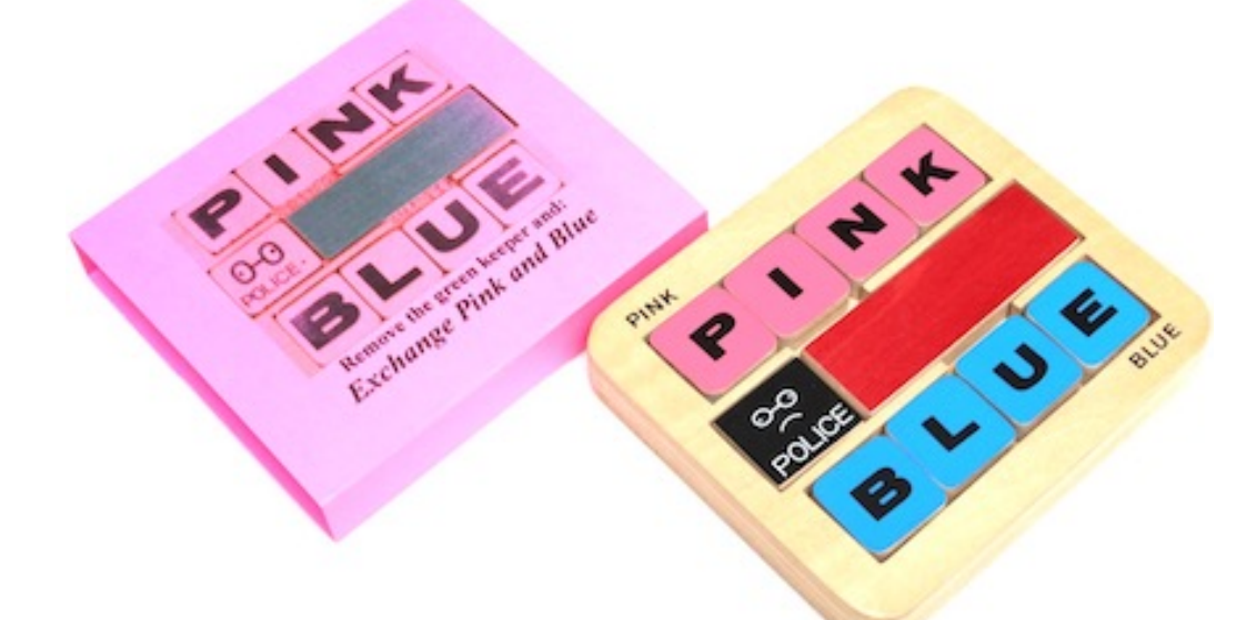
Designed and made by Nob Yoshigahara, circa 1985. (cardboard box 4.75" x 6.5" x 3/4" and wood puzzle 5+7/8" x 4+5/16" x 9/16"; 9 puzzle pieces and a green keeper piece to be removed; box cover art added by J. A. Storer)

Here is a second one, with the pieces removed on the right: